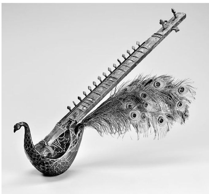
This Mayuri, mid-19th century instrument will be on display at the Cincinnati Art Museum during the World Choir Games.

Extended through July 15 for visitors, the show, "On Wings of Harmony," showcases thousands of butterflies from around the world. Krohn Conservatory. $6 adults, $5 seniors, $4